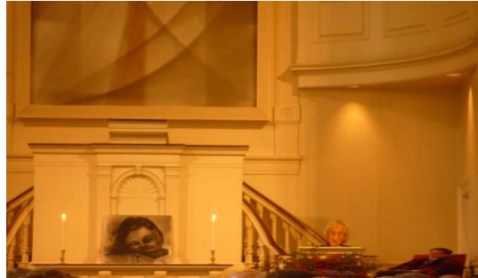
Baroness Greengross, Executive Chair of ILC-UK expressing her condolences

On behalf of ILC Global Alliance, one of Co-Chair Baroness Greengross, Executive Chair of ILC-UK made a speech of farewell.